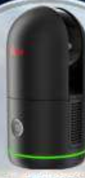
Leica BLK360 G2