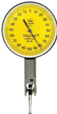
TESA TESAST LEVELER