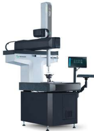
Hexagon CMM Machine