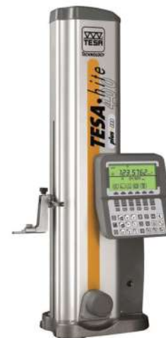
TESA-HITE Plus Height Gauge