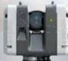
RTC 360 HDS