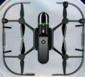
Leica BLK 2 FLY