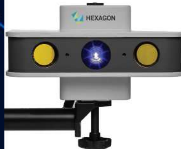
Hexagon Blue Light Scanner