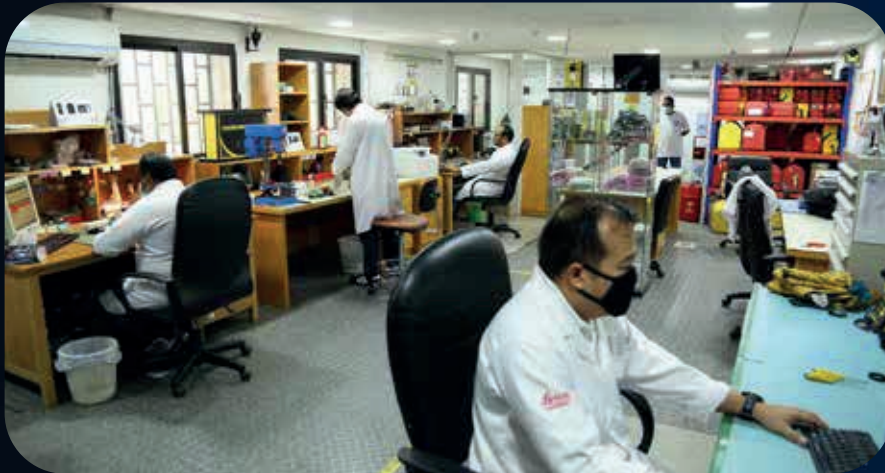
SITML Leica Geosystems Authorized Maintenance Centre, Jeddah