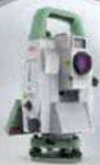
TS13 Total Station