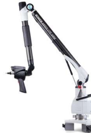
Romer Absolute Arm