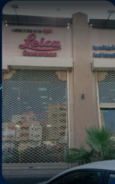
SITML Leica Geosystems Prince Nasser Bin Abdulaziz St, Al 'Adamah, Dammam 32242