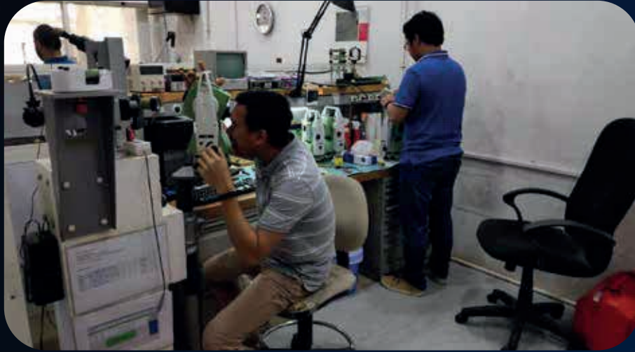
SITML Leica Geosystems Authorized Maintenance Centre, Jeddah