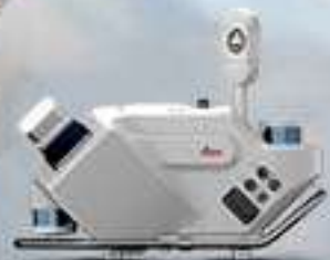
Leica Pegasus TRK