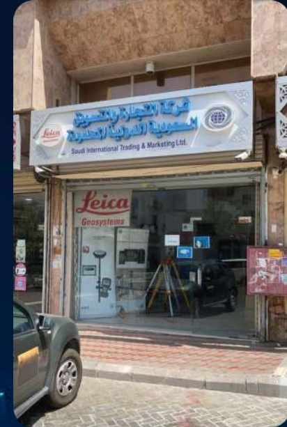
Adh Dhahirah, Madina Abdullah Bin Saad Al Zahri, 3317 Phone (+966 12 8287875)