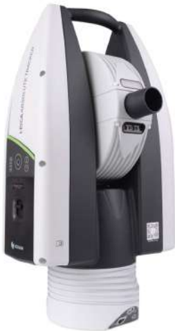
Leica Laser Tracker

Hexagon Metrology offers a comprehensive range of products and services for all industrial metrology applications in sectors as automotive, aerospace, energy and medical. Customers are supported with actionable measurement information along the complete life cycle of a product from development and design to production, assembly and final inspection.