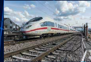
High Speed Railways