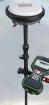
Leica GS16 GPS