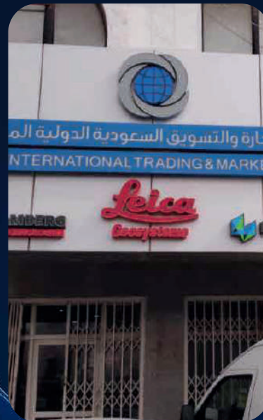
SITML Leica Geosystems Al Washm Street, Square Road Riyadh 12631