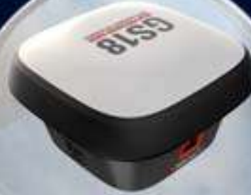
Leica GS18 GPS